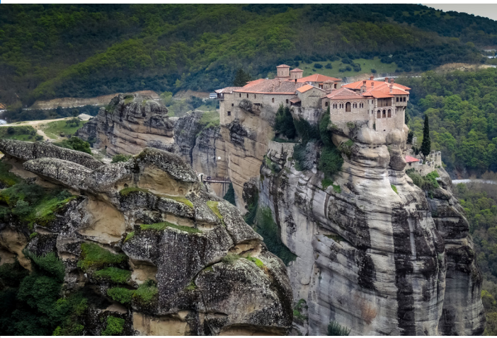
HANGING MONASTERIES OF METEORA